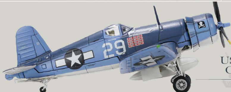
USN F4U-1 TM CORSAIR ® "JOLLY ROGERS"