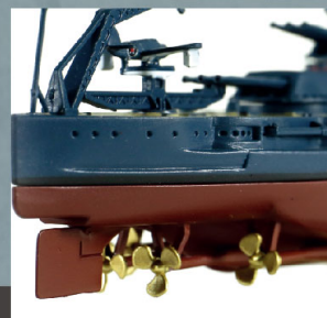
Die cast metal hull