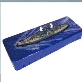
Warships can be displayed in battle mode nestled in their own sea wave blisters.