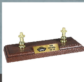
Wooden look display stand with chrome plated metal pillars.