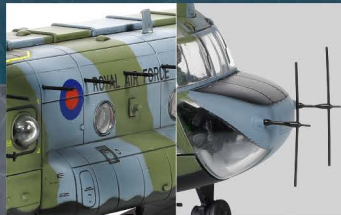
• Meticulous surface details