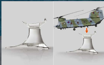
• Sturdy display stand