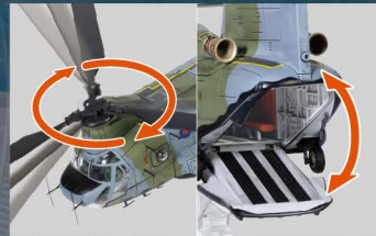
• Movable spinning blades and rear access ramp