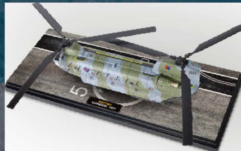
• Helipad pattern base on HMS Hermes (R12), where Bravo November ZA718 landed during Falklands campaign