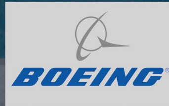
• Official licensed by the Boeing company