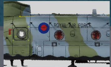
• Authentic camouflage pattern according real Bravo November ZA718