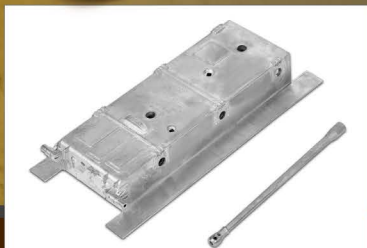
Diecast Chassis & CNC aluminum gun barrel.