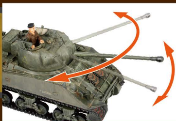
Rotating turrets and elevating guns