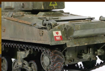
Rainfall weathering effect