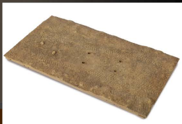
Realistic sectioned-landscape display