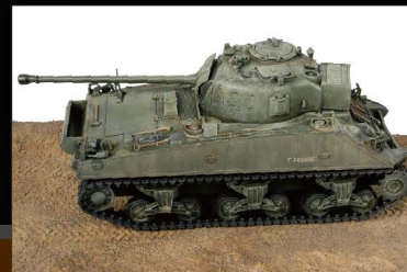
Model can be displayed transportation mode